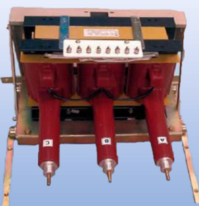
11kV DRAWOUT VOLTAGE TRANSFORMER