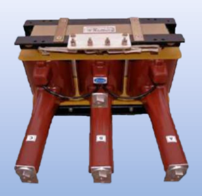
11kV FIXED VOLTAGE TRANSFORMER