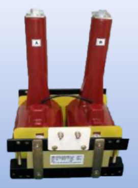
11kV CONTROL VOLTAGE TRANSFORMER